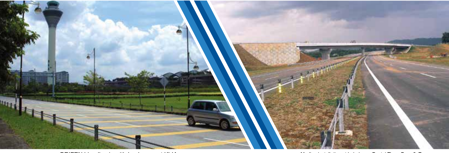
BRIFEN blending in with landscape at KLIA